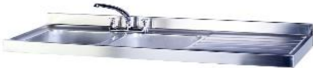
Image Shows Right Hand Drainer

Standard product without taps. Sink tops and stands available separately. Selected 316 grade sinks supplied as an option.